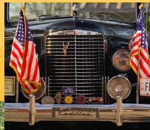
Left, many of our cars appear in local parades honoring veterans, holidays and charities. Below, our Fall Blue Ridge Mountains Cadillac Cruise.

So many opportunities to show off your Cadillac! Come along as we visit the big time collectors' showrooms around Georgia! Or come to one of our special events, like touring the Swan House or the Little White House in Warm Springs. There's an Easter Parade in April, a 3-day driving tour in the Spring, and a 2-day tour in the Fall. We try to visit a concours in the Spring ( Amelia Island ) or Fall ( Hilton Head ). The CLC Grand National is a week in the Summer. In the Fall there's the north Georgia apple orchards and drive-in movies , the Marist and Athens Classic Car Shows , the Oakland Cemetery Tour . At Christmas, we have a very stylish party with an exciting Cadillac auction and awards ceremony . February brings the annual Comstock Chili Cook-off . Great fun, beautiful cars and fabulous friends! Check our events calendar on the web site - www.PeachStateCLC.org