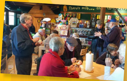
Special trips to car museums and participation in juried shows.

We're a very friendly bunch but we don't do regular meetings. That's because we're too busy cruising, picnicking and touring! We have something going almost every weekend for 11 months of the year. From February to December there are cruise-ins all around the metro ATL area . See the far right panel to get an idea of our meet-ups, cruise-ins, parades and more!