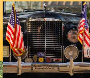
Left, many of our cars appear in local parades honoring veterans, holidays and charities. Below, our Fall Blue Ridge Mountains Cadillac Cruise.

So many opportunities to show off your Cadillac! Come along as we visit the big time collectors' showrooms around Georgia! Or come to one of our special events, like touring the Swan House or the Little White House in Warm Springs. There's an Easter Parade in April, a 3-day driving tour in the Spring, and a 2-day tour in the Fall. We try to visit a concours in the Spring ( Amelia Island ) or Fall ( Hilton Head ). The CLC Grand National is a week in the Summer. In the Fall there's the north Georgia apple orchards and drive-in movies , the Marist and Athens Classic Car Shows , the Oakland Cemetery Tour . At Christmas, we have a very stylish party with an exciting Cadillac auction and awards ceremony . February brings the annual Comstock Chili Cook-off . Great fun, beautiful cars and fabulous friends! Check our events calendar on the web site - www.PeachStateCLC.org