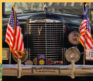
Left, many of our cars appear in local parades honoring veterans, holidays and charities. Below, our Fall Blue Ridge Mountains Cadillac Cruise.

So many opportunities to show off your Cadillac! Come along as we visit the big time collectors' showrooms around Georgia! Or come to one of our special events, like touring the Swan House or the Little White House in Warm Springs. There's an Easter Parade in April, a 3-day driving tour in the Spring, and a 2-day tour in the Fall. We try to visit Nashville or Huntsville, Western NC or the North Georgia mountains. The CLC Grand National is a week in the Summer. In the Fall there's the north Georgia apple orchards and drive-in movies , private collections (Cofer's), local attractions (Driving Miss Daisy tour) and mountain wineries (several).. At Christmas, we have a very stylish party with an exciting Cadillac auction and awards ceremony . February brings the annual Comstock Chili Cook-off . Great fun, beautiful cars and fabulous friends! Check our events calendar on the web site - www.PeachStateCLC.org