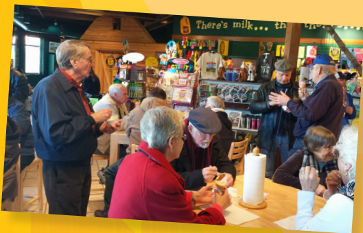
Special trips to car museums and participation in juried shows.

We're a very friendly bunch but we don't do regular meetings. That's because we're too busy cruising, picnicking and touring! We have something going almost every weekend for 11 months of the year. From February to December there are cruise-ins all around the metro ATL area . See the far right panel to get an idea of our meet-ups, cruise-ins, parades and more!