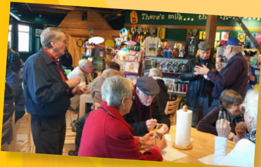
Special trips to car museums and participation in juried shows.

So many opportunities to show off your Cadillac! Come along as we visit the big time collectors' showrooms around Georgia! Or come to one of our special events, like touring the Swan House or the Little White House in Warm Springs. There's an Easter Parade in April, a 3-day driving tour in the Spring, and a 2-day tour in the Fall. We try to visit a concours in the Spring ( Amelia Island ) or Fall ( Hilton Head ). The CLC Grand National is a week in the Summer. In the Fall there's the north Georgia apple orchards and drive-in movies , the Marist and Athens Classic Car Shows , the Oakland Cemetery Tour . At Christmas, we have a very stylish party with an exciting Cadillac auction and awards ceremony . February brings the annual Comstock Chili Cook-off . Great fun, beautiful cars and fabulous friends! Check our events calendar on the web site - www.PeachStateCLC.org