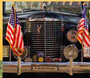
Left, many of our cars appear in local parades honoring veterans, holidays and charities. Below, our Fall Blue Ridge Mountains Cadillac Cruise.

So many opportunities to show off your Cadillac! Come along as we visit the big time collectors' showrooms around Georgia! Or come to one of our special events, like touring the Swan House or the Little White House in Warm Springs. There's an Easter Parade in April, a 3-day driving tour in the Spring, and a 2-day tour in the Fall. We try to visit Nashville or Huntsville, Western NC or the North Georgia mountains. The CLC Grand National is a week in the Summer. In the Fall there's the north Georgia apple orchards and drive-in movies , private collections (Cofer's), local attractions (Driving Miss Daisy tour) and mountain wineries (several).. At Christmas, we have a very stylish party with an exciting Cadillac auction and awards ceremony . February brings the annual Comstock Chili Cook-off . Great fun, beautiful cars and fabulous friends! Check our events calendar on the web site - www.PeachStateCLC.org