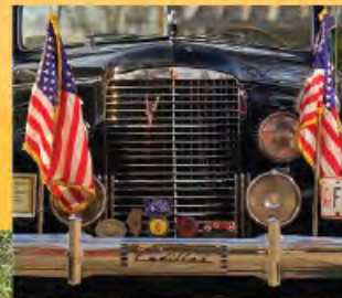
Left, many of our cars appear in local parades honoring veterans, holidays and charities. Below, our Fall Blue Ridge Mountains Cadillac Cruise.

So many opportunities to show off your Cadillac! Come along as we visit the big time collectors' showrooms around Georgia! Or come to one of our special events, like touring the Swan House or the Little White House in Warm Springs. There's an Easter Parade in April, a 3-day driving tour in the Spring, and a 2-day tour in the Fall. We try to visit Nashville or Huntsville, Western NC or the North Georgia mountains. The CLC Grand National is a week in the Summer. In the Fall there's the north Georgia apple orchards and drive-in movies , private collections (Cofer's), local attractions (Driving Miss Daisy tour) and mountain wineries (several).. At Christmas, we have a very stylish party with an exciting Cadillac auction and awards ceremony . February brings the annual Comstock Chili Cook-off . Great fun, beautiful cars and fabulous friends! Check our events calendar on the web site - www.PeachStateCLC.org